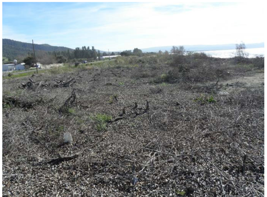
Production of plants for the in situ actions & Control of the invasive species ( Acacia saligna )