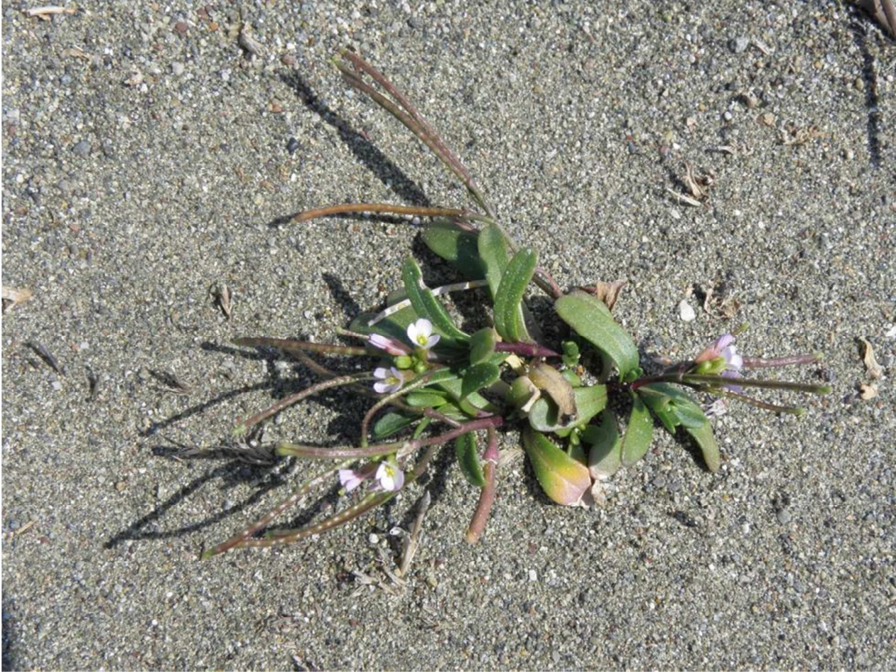
Fig 2: An overview of Maresia nana var. glabra