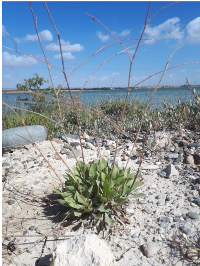
An overview of Limonium mucronulatum & Plant established as part of the reinforcement actions just before flowering