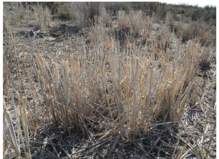
Soft fencing in order to prevent uncontrolled vehicle driving through the habitat of the plant & Control of the competing vegetation ( Phragmites australis )