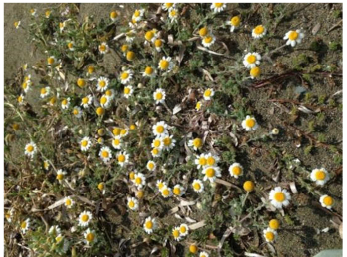
An overview of Anthemis tomentosa & Plants at flowering from the translocation of the species to Akamas area