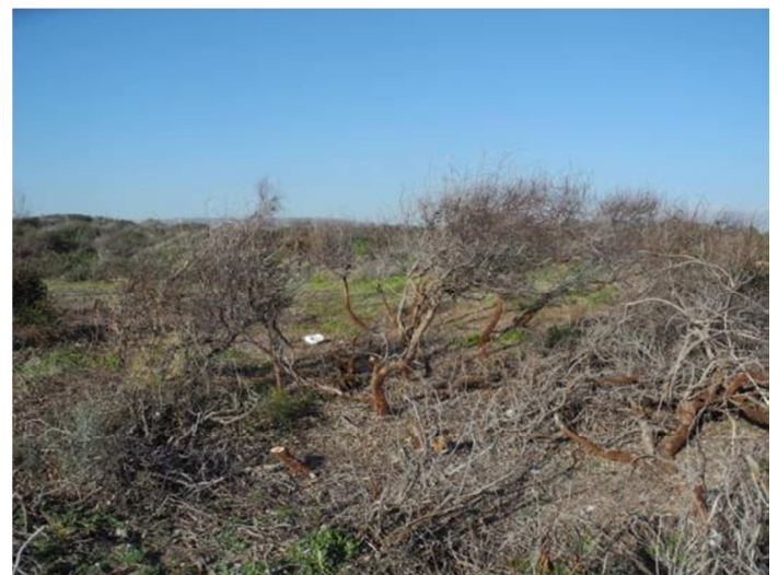
Restriction barriers at Timi area to prevent access to vehicles & Control of invasive species ( Acacia saligna ) at Timi area