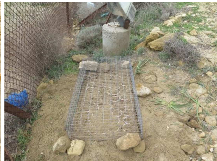
Information sign and light fencing; Pots with seeds covered with a protective structure