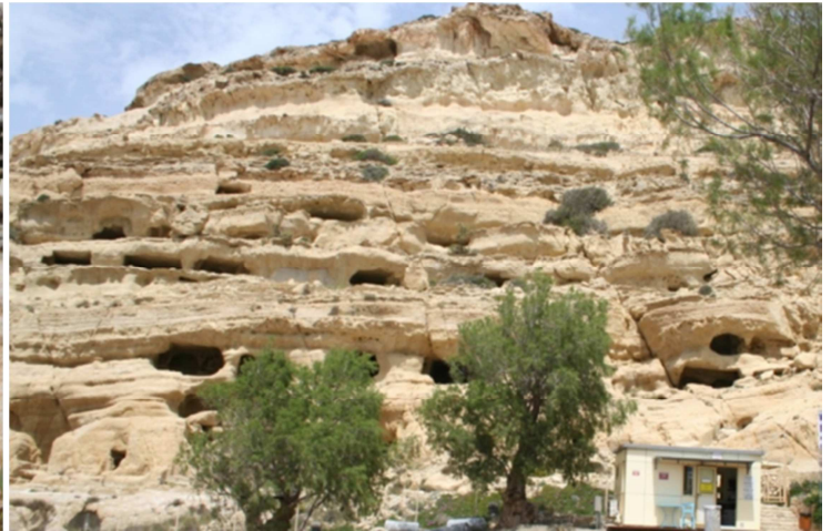
Reseda minoica plant & habitat