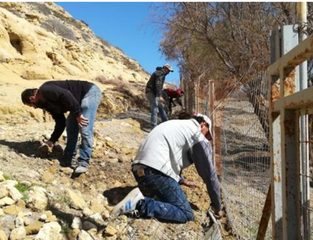
Invasive species, Carpobrotus edulis & its removal