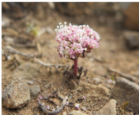
Horstrissea dolinicola habitat; H. dolinicola in flowering