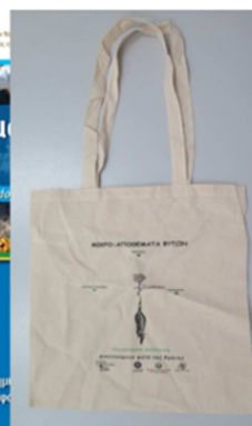
Information day for local stakeholders at Anogeia Primary School; Dissemination materials for H. dolinicola Micro-Reserve