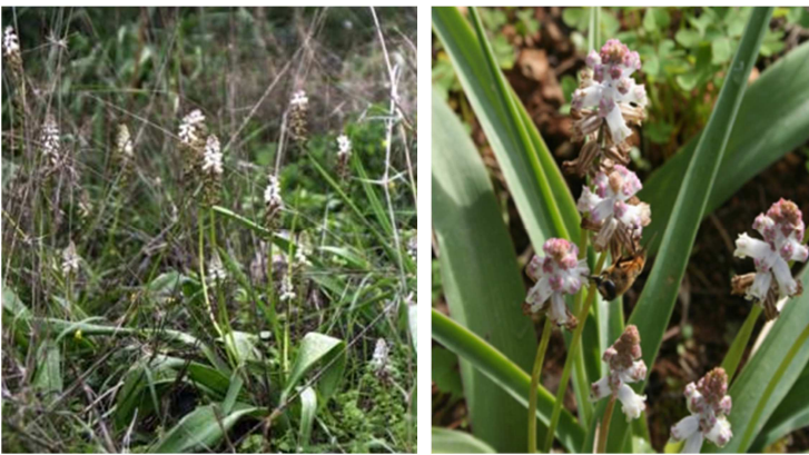
Bellevalia brevipedicellata at full flowering