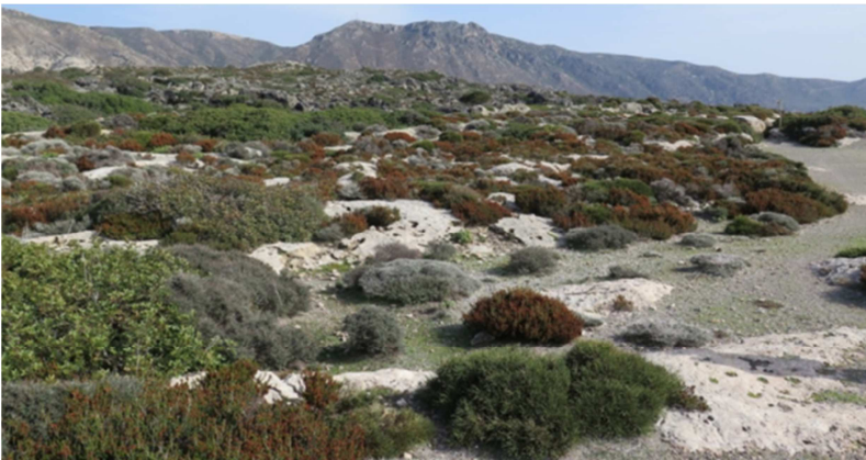
Elafonisi area with Bellevalia brevipedicellata population