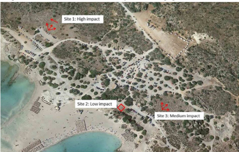
Bellevalia brevipedicellata reinforcement map