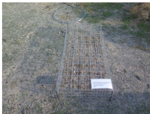
Reinforcement actions outside fenced area & View of protective structure