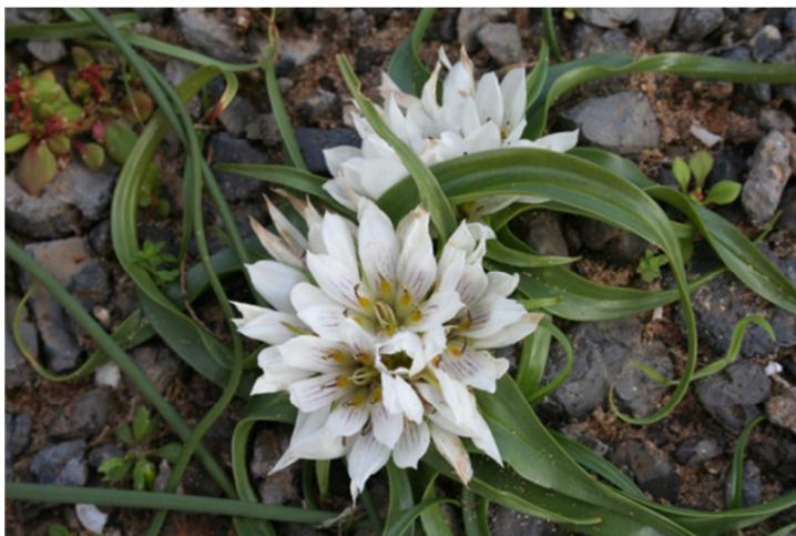
Androcymbium rechingeri in flowering