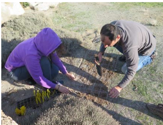
Metal grid stabilization & Planting of seedlings within fenced area