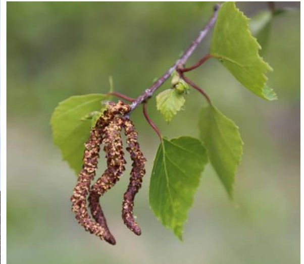
Individual of Betula aetnensis (Mts. Sartorius, NE Etna) & Inflorescences (male) of Betula aetnensis (Mt. Galvarina, W Etna)