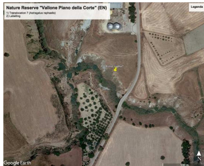
Localization of the new populations of Astragalus raphaelis within the N.R. “Vallone Piano della Corte” (Enna)