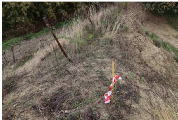
Left: Astragalus raphaelis from Enna (central Sicily). Right: Translocation of Astragalus raphaelis (N.R. “Vallone Piano della Corte”, Enna)