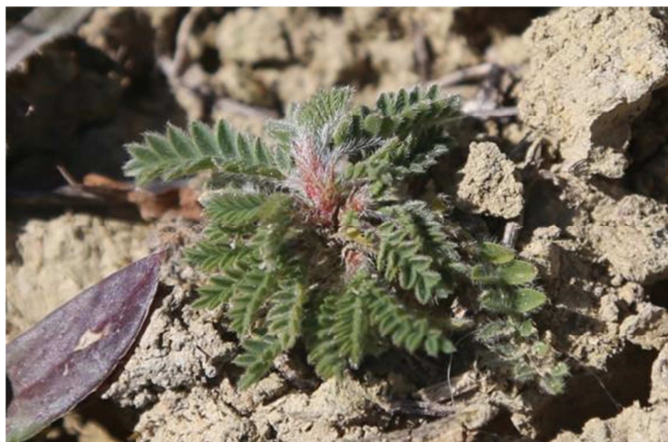
Left: Translocation of Astragalus raphaelis (N.R. “Vallone Piano della Corte”, Enna). Right: Translocated plant of Astragalus raphaelis (N.R. “Vallone Piano della Corte”, Enna)