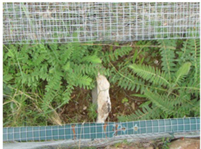
In situ action : protection and direct sowing (13/12/2016); Appearance of plants after 1 year