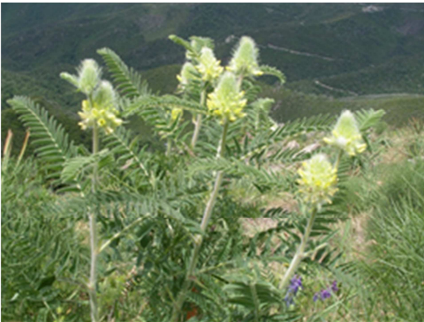
General appearance of A. alopecurus