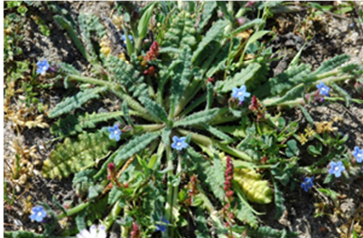
Anchusa crispa flowers (left) & General aspect of A. crispa (right)